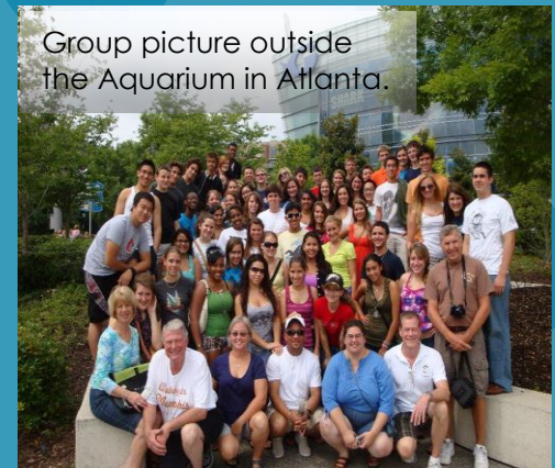
Group picture outside the Aquarium in Atlanta.

ICON! The 68th Annual Key Club International Convention will take place in Phoenix, Arizona June 29-July 3, 2011. But here are photos from this year's ICON.