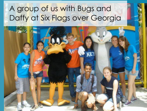
A group of us with Bugs and Daffy at Six Flags over Georgia