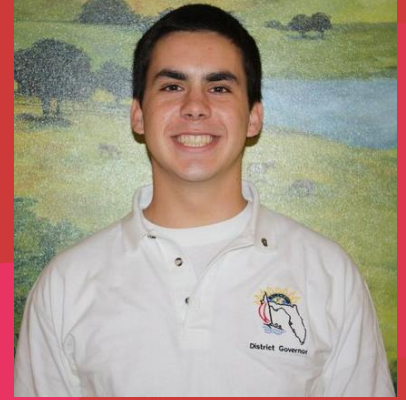
Our District Governor!