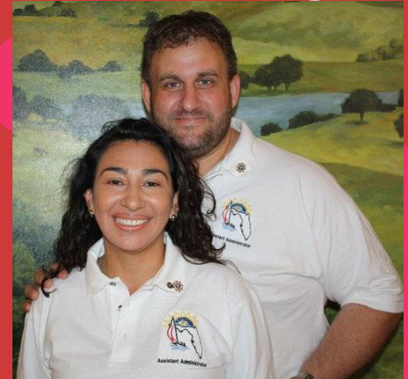
Assistant Administrators for Zone