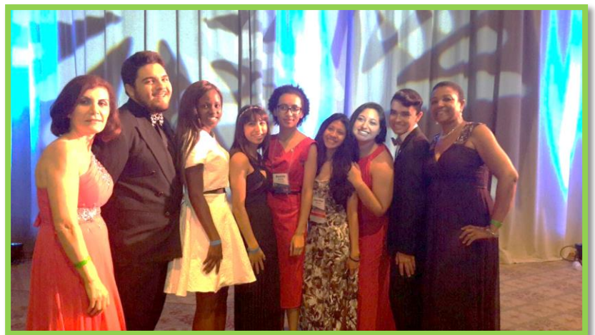
Zone K Leaders