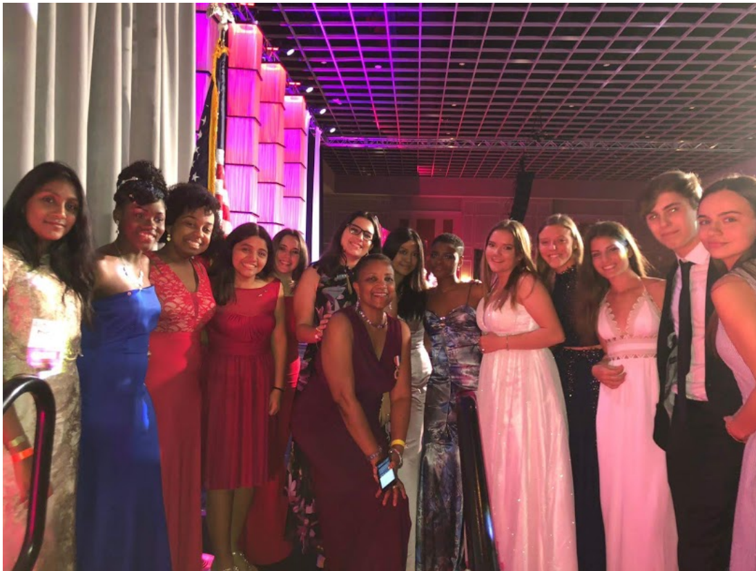
2018 - 2019 & 2019 - 2020 Zone K Lt. Governors with Zone K-26 Administrator and 2019 - 2020 District Governor!